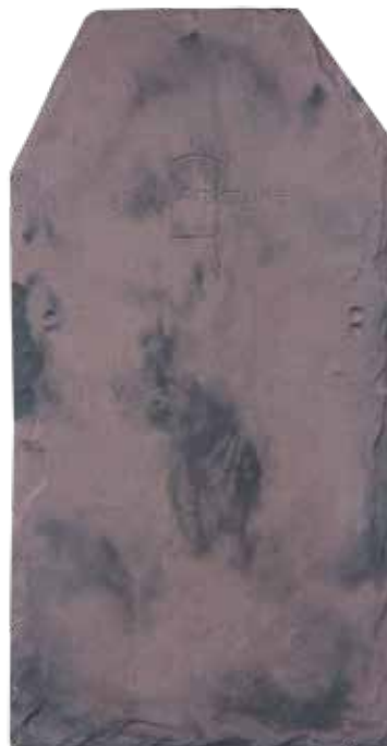
Reproduction Reclaimed Purple Slate

SIG Roofing, Harding Way, St Ives, Cambridgeshire, PE27 3YJ Tel: 01480 466777 Fax: 01480 302586 Email: info@sigroofing.co.uk Web: www.sigroofing.co.uk