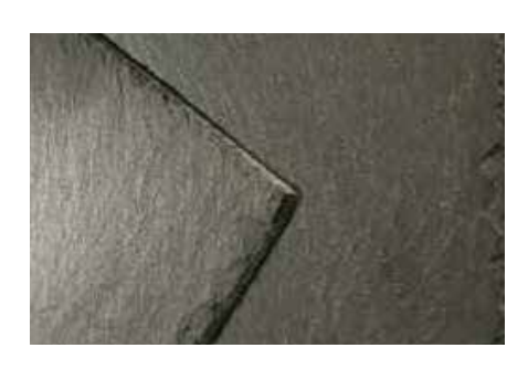
SIGA 39 is an outstandingly successful first selection slate from the Specification range that is flat, uniform and of consistent 5.5m thickness

Steve Linwood, building surveyor, Tower Hamlets